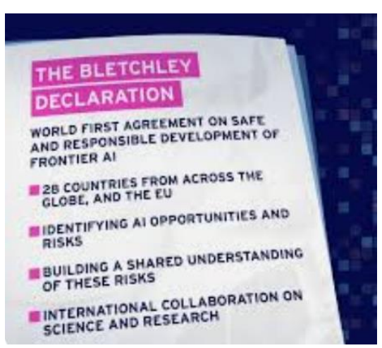
The Bletchley Declaration signed by attendees at the first AI Safety Summit in November 2023

8. In essence, the fast and evolving field of AI holds the potential to yield unprecedented technological growth that could be coupled with catastrophic outcomes for nations, societies and individuals. As responsible members of the international community, it is necessary that countries continue to participate in dialogues encouraging the responsible development and use of AI, including establishing clear guidelines for the development, deployment, and use of AI technologies among the different sectors. That said, these debates should be balanced with the need to create space for cutting-edge technology to thrive. Our approach towards AI technologies could signal the boon or bane for the information landscape for nations and societies. We should therefore remain vigilant while embracing the rapid rise of AI, and leverage these technologies to pave the way to a brighter future for humankind.